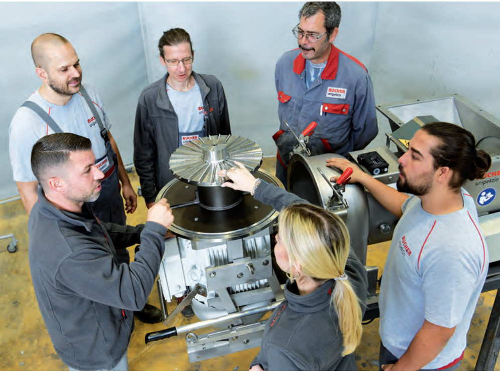
Here the team carries out practical maintenance. The operation of the grinder is explained to the participants.