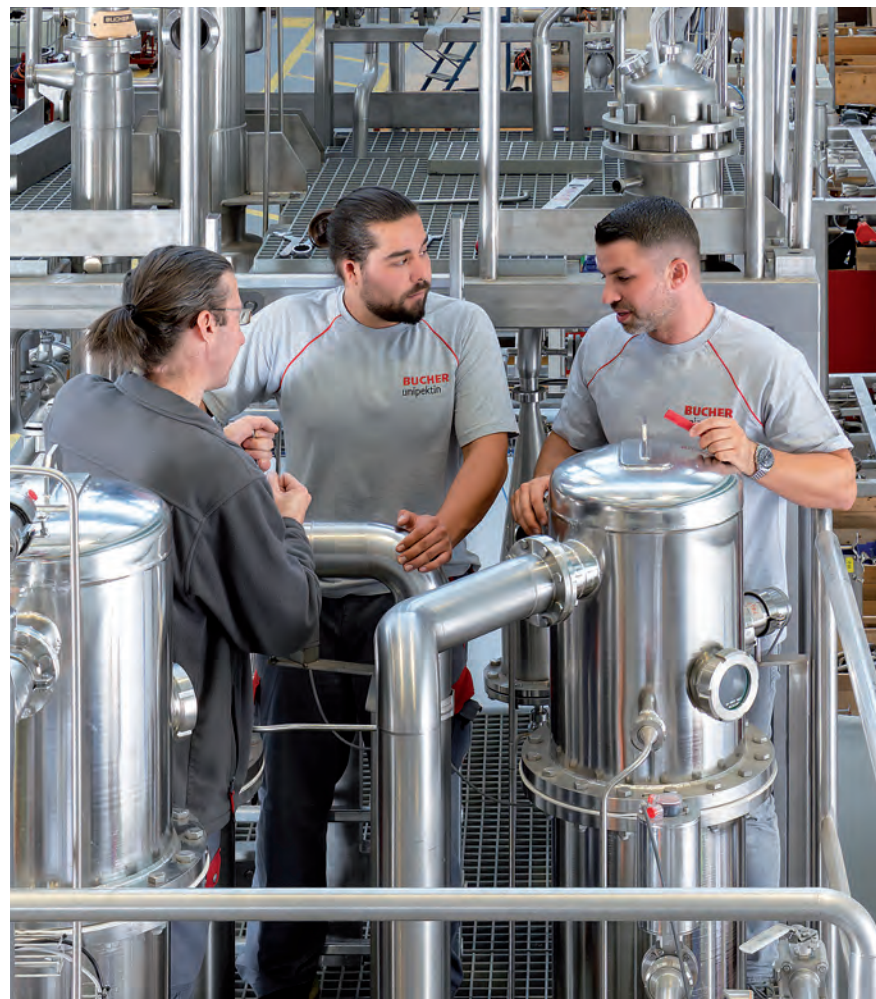
Participants learn how the product is distributed in the evaporators to internalise the troubleshooting process.