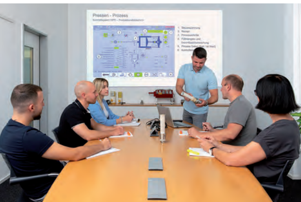
The training participants receive a theoretical explanation of how the presses operate.